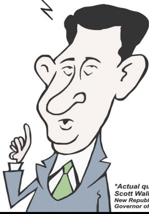
*Actual quote: Scott Walker, New Republican Governor of Wisconsin

"WE CAN NO LONGER LIVE IN A SOCIETY WHERE THE PUBLIC EMPLOYEES ARE THE HAVES AND TAXPAYERS WHO FOOT THE BILLS ARE THE HAVE-NOTS."*